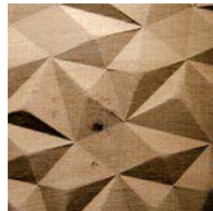
Knob oak Real wood veneer