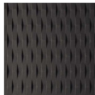
Black Fineline veneer