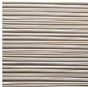
White Fineline veneer

Straightness: 3.0 mm per Metre Size accuracy: +/- 1.0 mm per Metre Thickness allowance: +/- 0.3 mm Exactitude of profile: +/- 1.5 mm