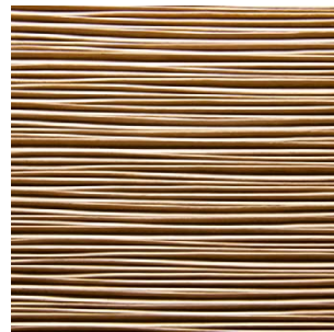
Light Oak Fineline veneer